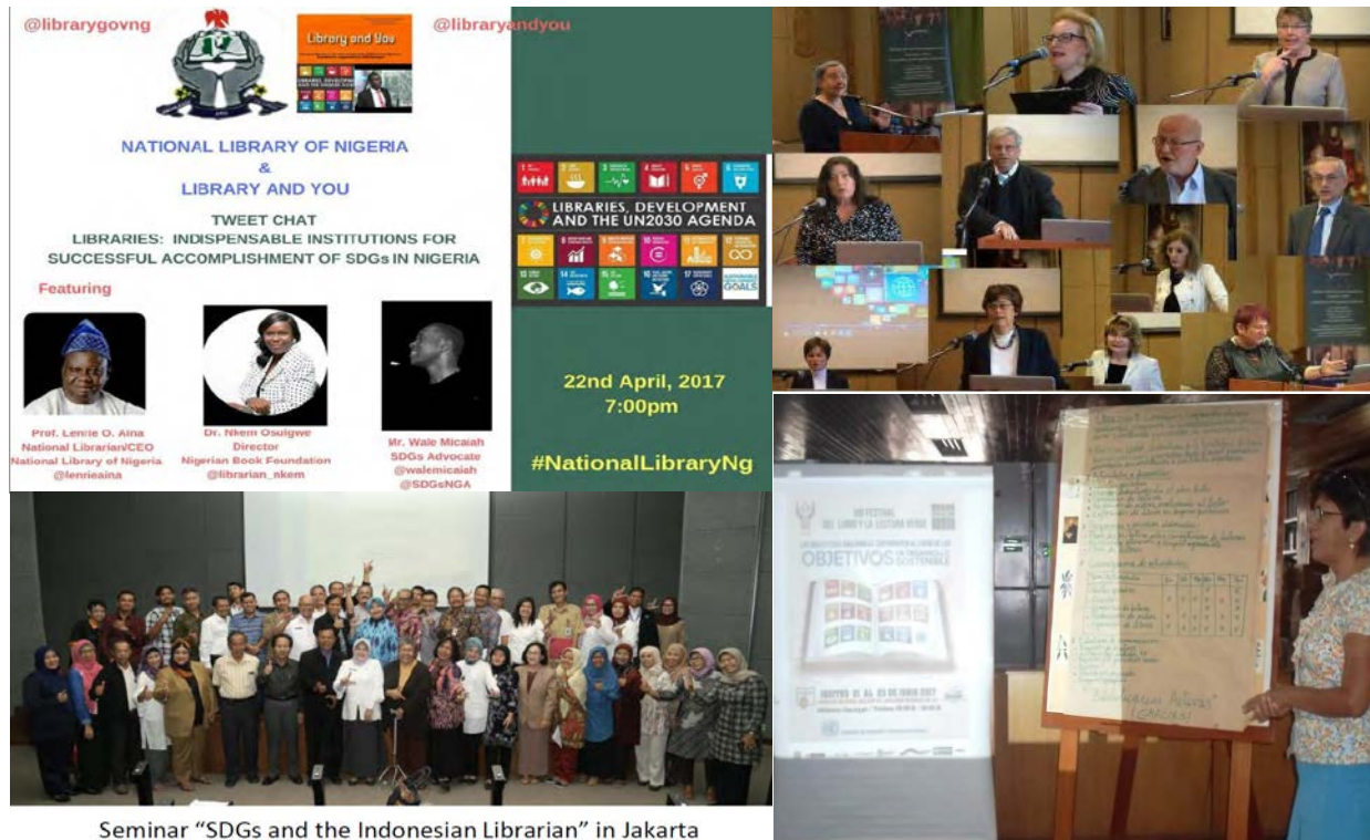
Seminar "SDGs and the Indonesian Librarian" in Jakarta