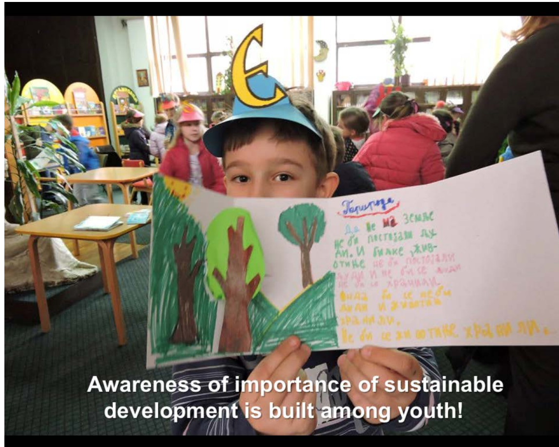
Awareness of importance of sustainable development is built among youth!

Uzice's public library is located in the center of a small town. Despite the poor conditions, enthusiasm and creativity rule the day. They are building an awareness of sustainable development and environmental protection among the local youth of all ages.